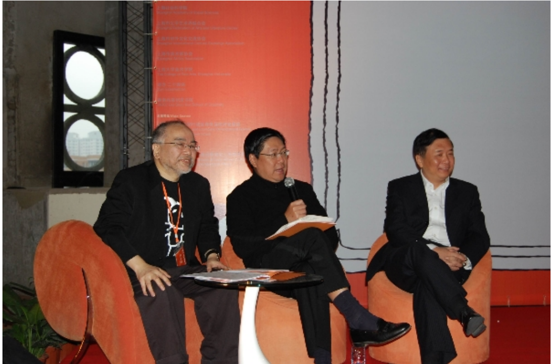
The Secretary for Commerce and Economic Development, Mr Frederick Ma (centre), exchanges views with the participants of the "Hong Kong Creativeness" seminar on ways to enhance co-operation between Hong Kong, Shanghai and the Yangtze River Delta, in creative industries.